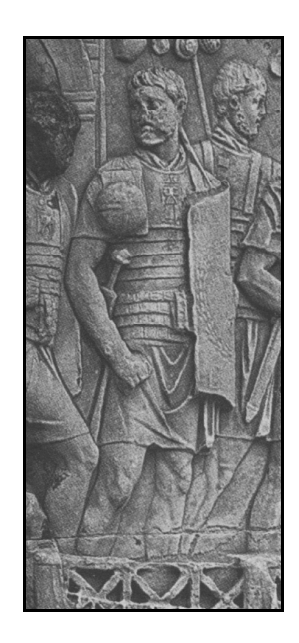
Figure VII.1: Traian's Column Rome: Soldier with four belts.

The representation of the hanging apron also contributes to this, which usually begins on the second rail from the bottom (sometimes also on a higher rail) which is impossible due to the construction. Therefore, this splint must represent the belt, which originally was probably different in color from the rest of the splint armor and is also shown shod with rectangular metal plates on some soldiers. This assumption can be confirmed by a depiction on Traian's Column, in which the sculptor erroneously turned four rails of the armor into belts by working out metal plates (see Figure VII.1).